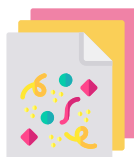
Paper with glitter