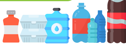
Kitchen, bathroom & laundry containers # 1, 2 & 5