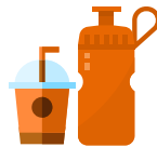
Any plastics # 3, 4, 6 & 7