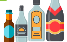
Wine, beer & spirit bottles